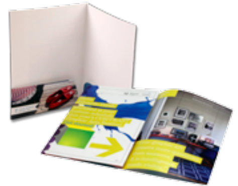
New marketing collateral possibilities. Pocket folders and 6-page folded brochures.

Use HP SmartStream products and partner solutions with the HP Indigo 10000 Digital Press to improve production efficiency and support digital growth. To learn more visit hp.com/go/smartstream