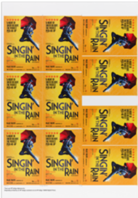
Imposition efficiency. Print 5.83 x 8.27 inch event flyers 10 up on a 29 inch sheet.