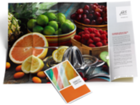
Direct mail. Large-sized poster pieces

Inline and near line finishing. Digital inline and near line finishing devices with automatic setup, instant make-ready, and automated error recovery leverage digital capabilities to achieve higher levels of productivity. Solutions include the Horizon Smart Stacker and MBO signature folder.