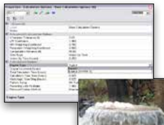
SewerGEMS' full dynamic engine allows users to evaluate systems for surcharges and overflows.

The included LoadBuilder module helps modelers allocate sewer loads based on a variety of GIS-based sources such as customer water use billing data, area-wide flow measurement, or polygons with known population or land use. Sewer loading can also be applied as user-defined hydrographs, pattern-based loads, and unit loads. Engineers can access and customize the comprehensive unit (dry weather) load engineering library with numerous typical unit loads based on population, area, count, and discharge. SewerGEMS also allows users to input and save an unlimited number of flow patterns, to accurately model flow changes over the course of a day. Engineers can also load models with wet weather runoff flows derived from precipitation, using SewerGEMS built-in rainfall distributions, or user-defined rainfall events.