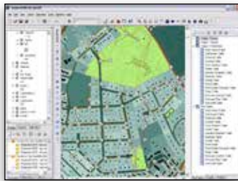
Create models easily using the stand alone, MicroStation, ArcGIS, or AutoCAD platforms.

From urban sewer planning to overflow remediation analysis to optimized best management practices designs, SewerGEMS provides an easy-to-use environment for engineers to analyze, design, and operate sanitary or combined conveyance sewer systems, using built-in hydraulic and hydrology tools, and a variety of wet-weather calibration methods.